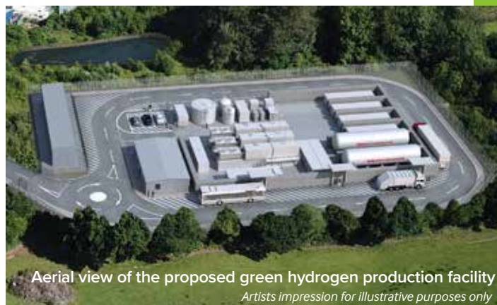
Aerial view of the proposed green hydrogen production facility Artists impression for illustrative purposes only